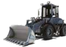
COMPACT WHEEL LOADERS